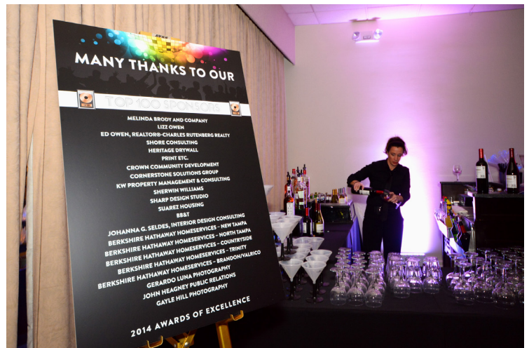
Putting our AOE Sponsors in the Spotlight – Placed in Strategic Locations at Event